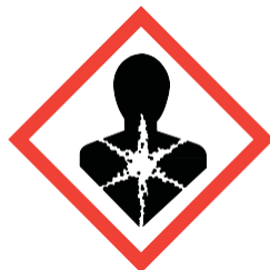
GHS08: Health Hazard