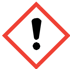
S07: Exclamation Point